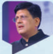
Mr. Piyush Goyal Hon'ble Minister of Railways & Minister of Coal Govt. of India