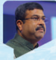
Mr. Dharmendra Pradhan Hon'ble Minister of Petroleum and Natural Gas & Minister of Skill Development and Entrepreneurship